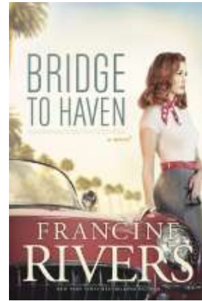
BRIDGE TO HAVEN BY FRANCINE RIVERS

To those who matter in Hollywood, Lena Scott is the hottest rising star to hit the silver screen since Marilyn Monroe. Few know her real name is Abra. Even fewer know the price she'd paid to finally feel like she's somebody.